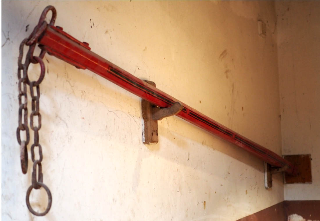
Coach Draw bar approx. 3m long

If you have any recollections, stories, pictures or detail on the coach, we would love to hear from you.