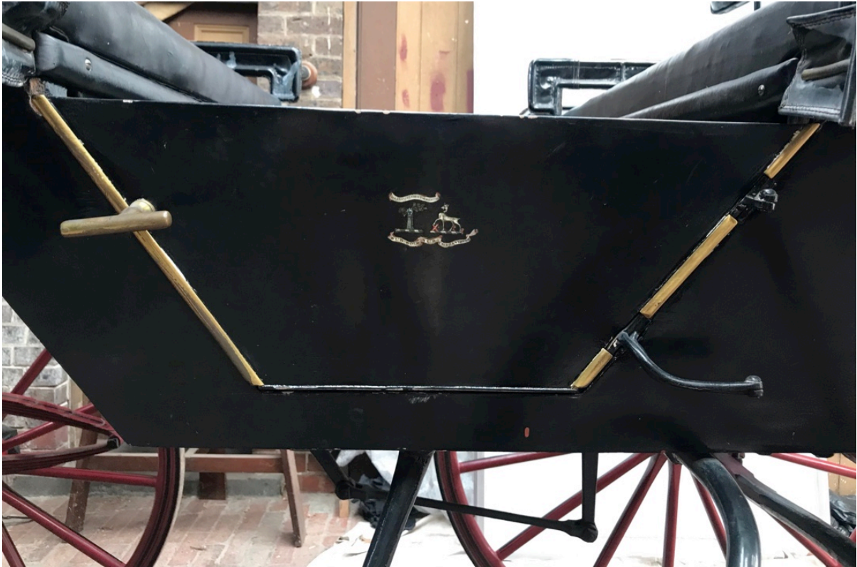
The Coat of Arms on the LH door